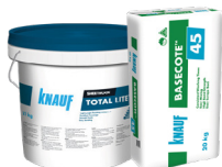
Knauf Finishing & Jointing Compound