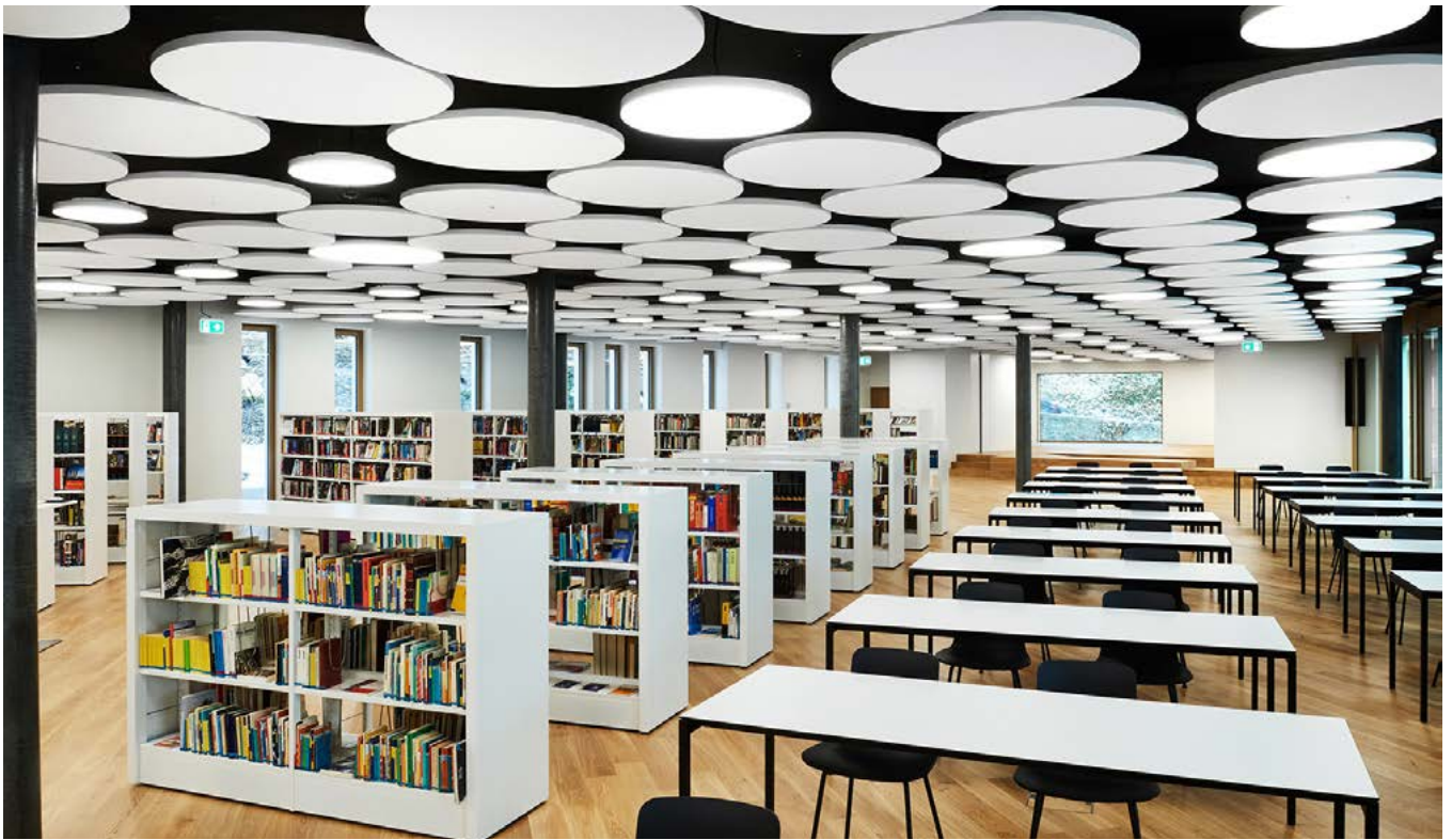
Ceiling solution: MINERAL Sonic Element