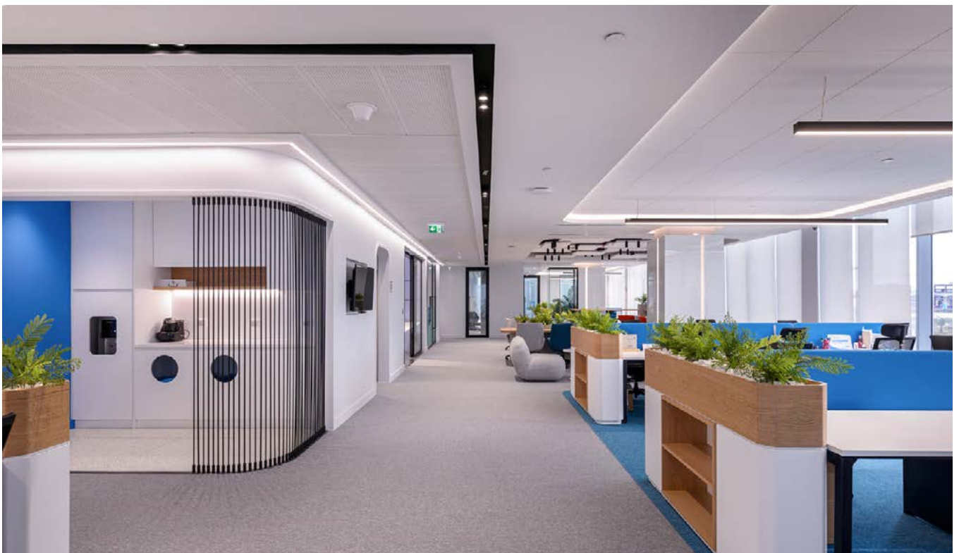
Ceiling solutions: AMF THERMATEX® Alpha HD, MINERAL Sonic Element, DANOLINE Corridor