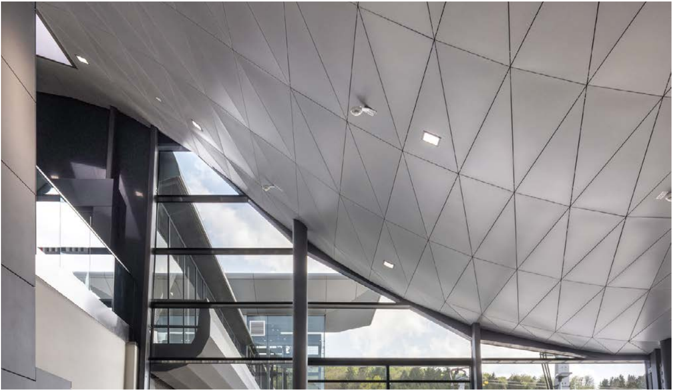
Ceiling solution: METAL R-H 215