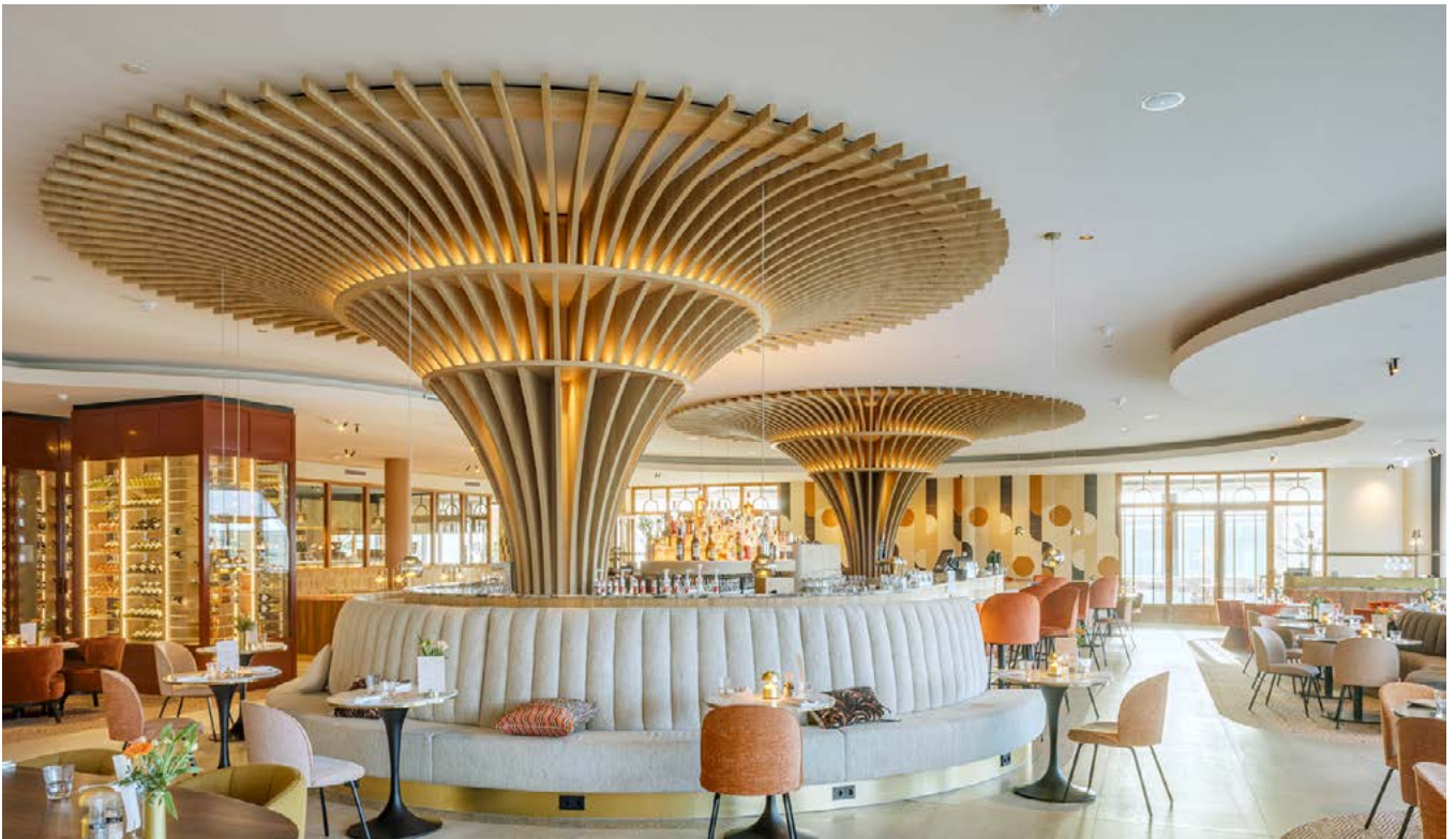
Ceiling solution: Seamless Acoustics