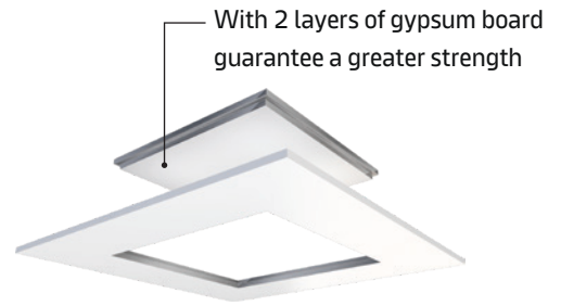
▶ Moisture Resistant