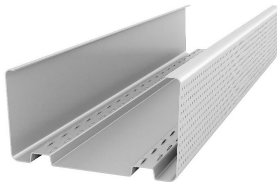
Figure 1. Illustration of one of the products within the product category Steel profile systems, for which this EPD is valid.