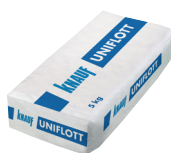
Uniflott Jointing Compound