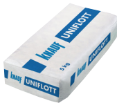
Uniflott Jointing Compound