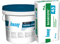
Knauf Finishing & Jointing Compound