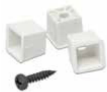
Cleaneo Screw Caps (limited seismic applications)