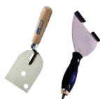
Jet Spatula & Jet Trowel