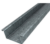
Rondo Concealed Ceiling System components (inc. 605 furring channel)