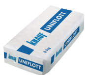
Uniflott Jointing Compound