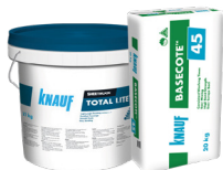
Knauf Finishing & Jointing Compound