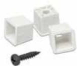
Cleaneo Screw Caps (limited seismic applications)