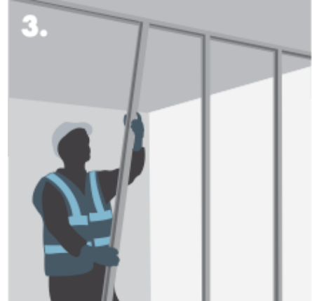
3. Twisting Knauf 'C' Stud into position.