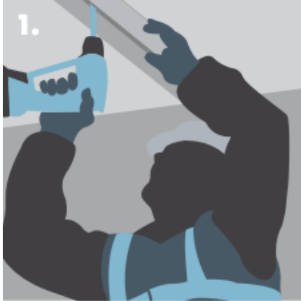
1. After fixing the head track, the floor track should be positioned by using a vertical stud a laser/ spirit level.

Knauf Systems are designed to be simple and fast to install. Knauf Technical Services are on hand should you have any questions or unusual situations to deal with.