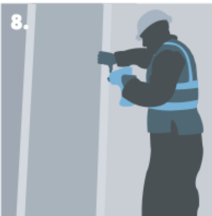
8. Fixing Knauf Plasterboard to the completed framework.