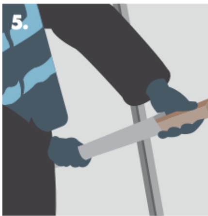
5. Insert timber battens within Knauf 'C' Studs to provide fixing for door frame (if required).