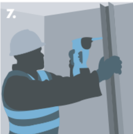
7. Fixing Knauf Deep Flange 'U' Channel to studs at door opening.