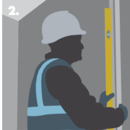
2. Fixing Knauf 'C' Stud to form the partition frame abutment.