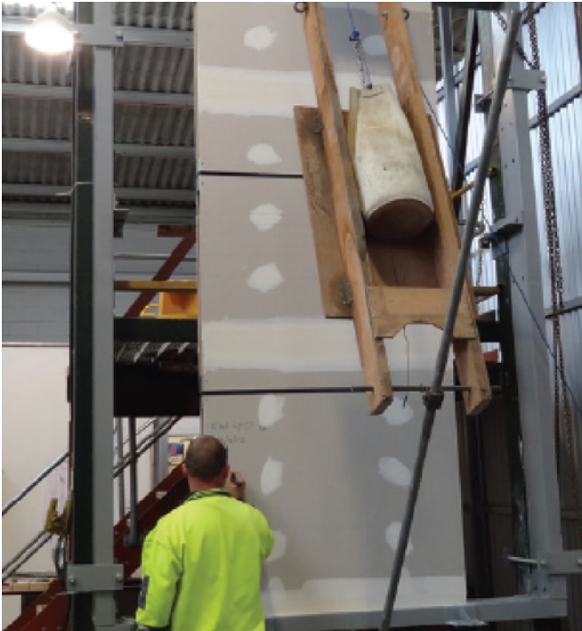
Soft body impact to NCC requirements